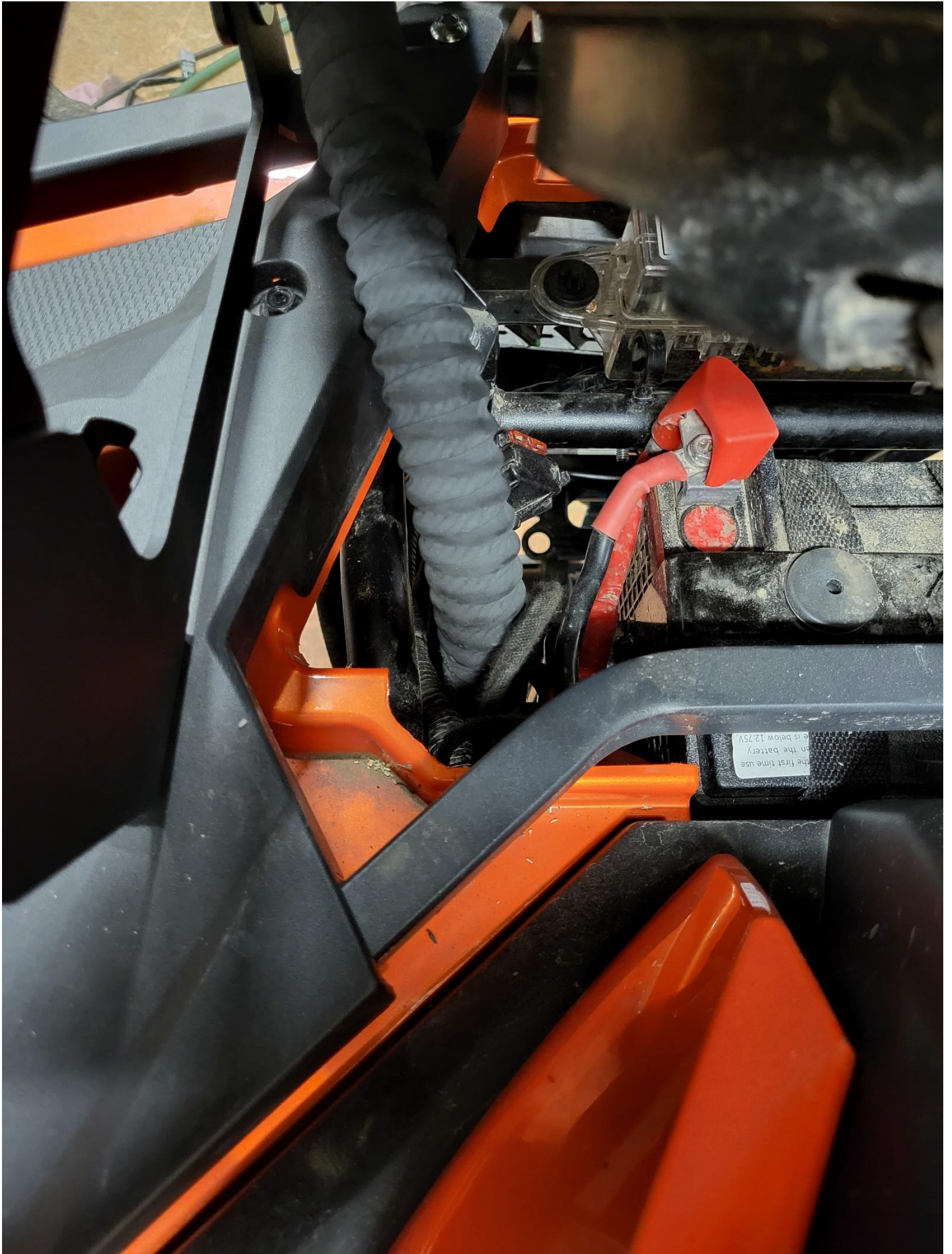
Connect lower water hose.