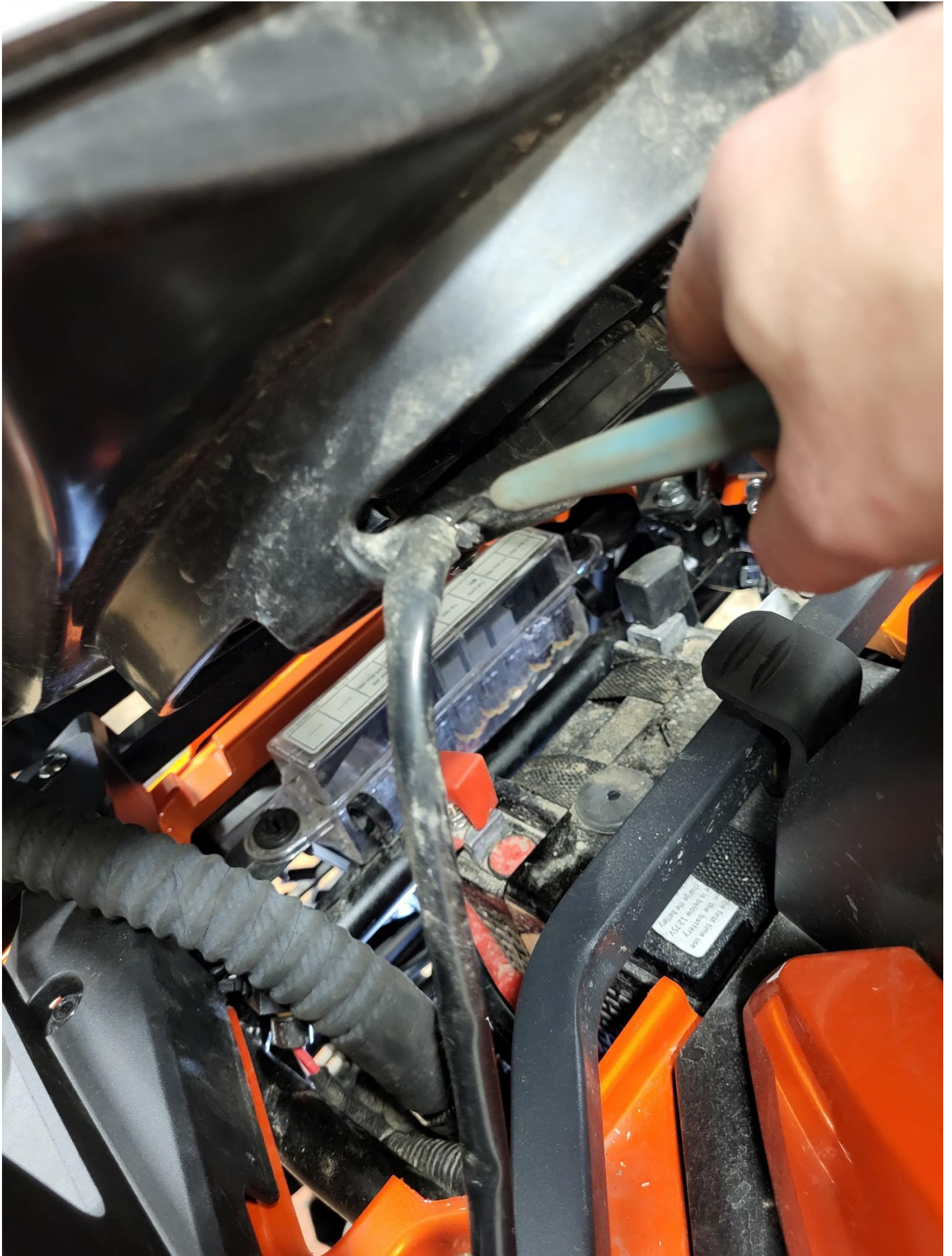
Cut zip tie and connect fan wire.